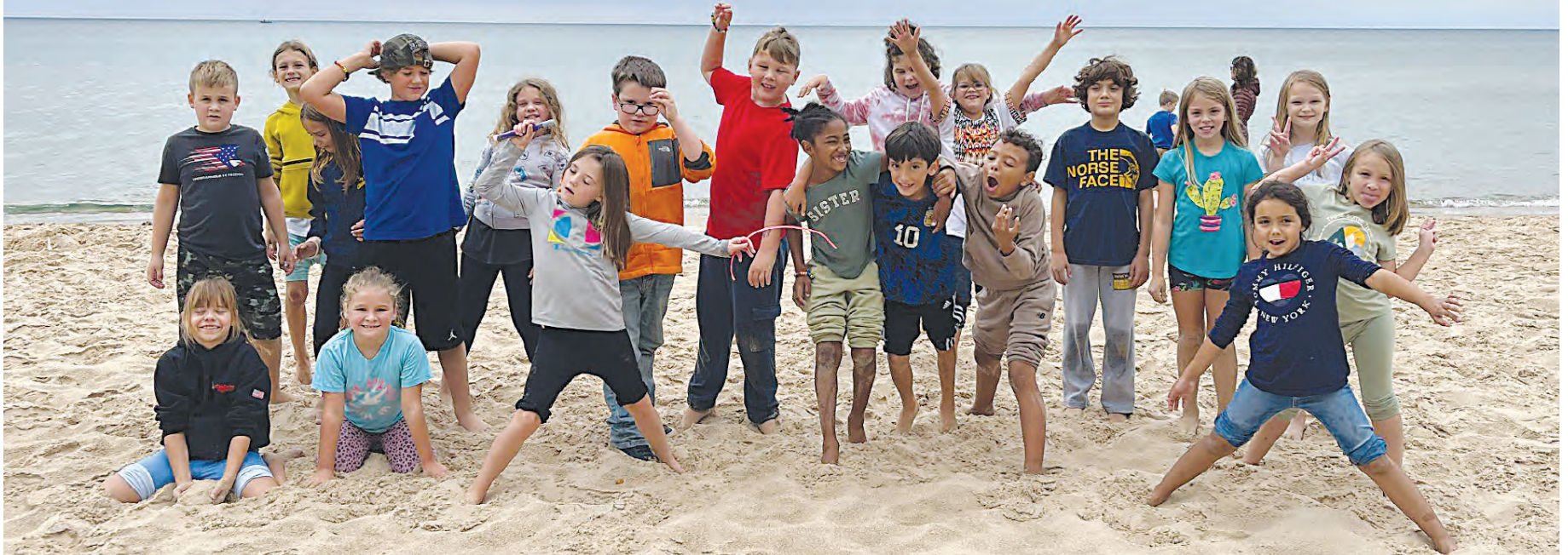
Ms. Cutler's Third Grade class enjoyed a day at Pioneer Park in September!