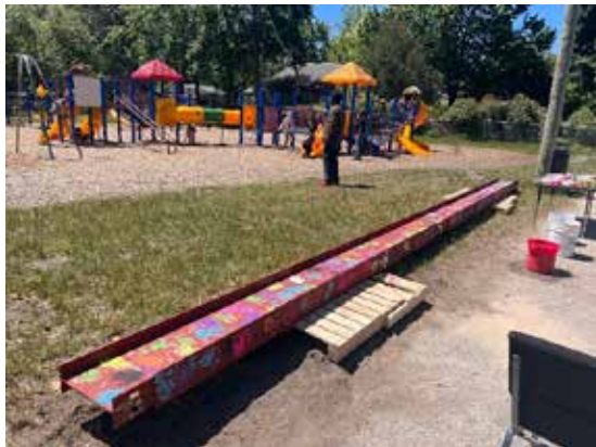
Community Fun Event