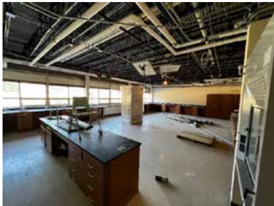
Classroom Demo and MECH Rough-In