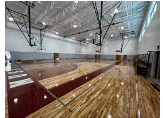
Gym Equipment and Gym Floor Finished