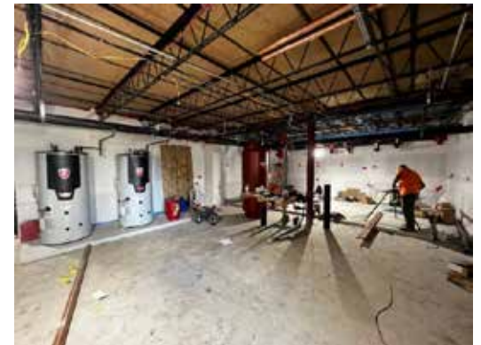
Mechanical Room Work