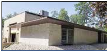
5145 Industrial Park Drive Montague | $289,000