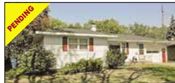
1542 W Summit Muskegon | $99,900