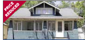
1845 Manz Muskegon | $67,900