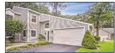
2956 Ridgeview North Muskegon | $219,900