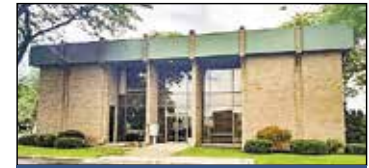
3145 Henry Street Muskegon | $850,000