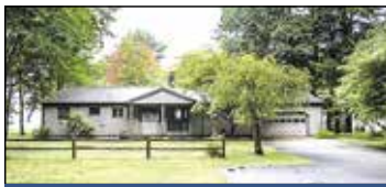
1309 Scenic Drive Muskegon | $849,900