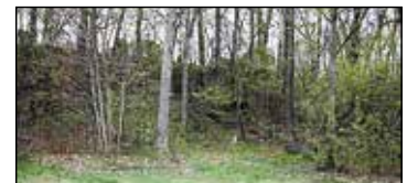
View Lane | N. Muskegon $14,000-$18,000