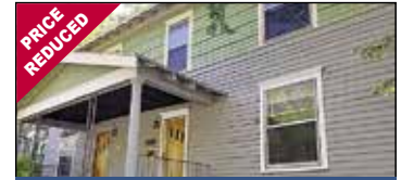
1127 6th Street Muskegon | $59,900