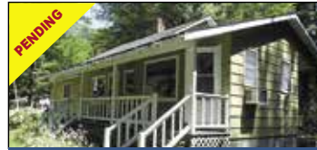
9104 Lamos Road Montague | $89,900