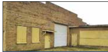
1208 8th Street Muskegon | $250,000

Troy Wasserman 231-750-9627 Bryan Bench 231-578-2508