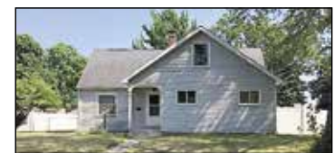
1313 Mills Avenue North Muskegon | $140,000