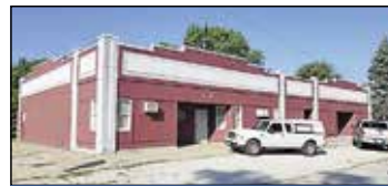
309 S. Jackson Ave Muskegon | $25,000