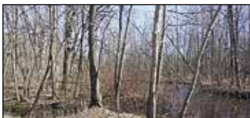
S. Dangl Road Muskegon | $39,900