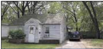
1337 Langeland Ave Muskegon | $64,900