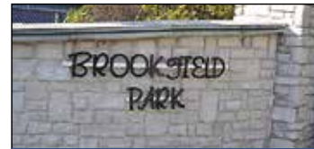
0 Brookfield Park Spring Lake | $160,000