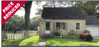
683 School Street Muskegon | $110,000