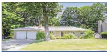
3908 Applewood Lane Norton Shores | $249,900