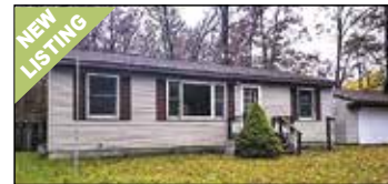
591 S Brooks Muskegon | $104,900