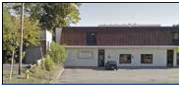
420 Whitehall Road N. Muskegon | $12 PER SQFT