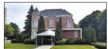
1102 Terrace and 77 Hartford Muskegon | $19K - $199K