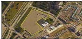
372 Morris Avenue Muskegon | $1,200,000