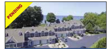
6698 Lakeshore Rd Unit 12 Manistee | $355,000