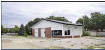
1390 Whitehall Road Muskegon | $295,000