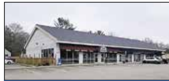
2190 Whitehall Road Muskegon | $500,000