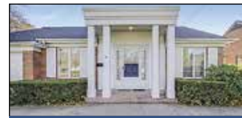
1637 Ruddiman Drive North Muskegon | $399,900