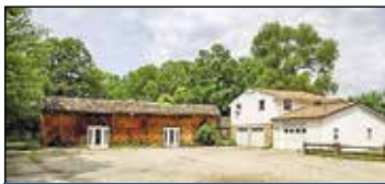
836 Dykstra Muskegon | $199,000