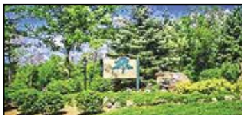
Stonegate Properties Twin Lake | $27,900-$39,900