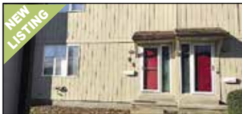
1368 W Norton Ave #6 Muskegon | $119,000