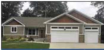
3811 Harbor Breeze Drive Norton Shores | $324,900