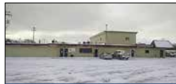
3162 Heights Ravenna Road Muskegon | $8.56-$11.00 SF