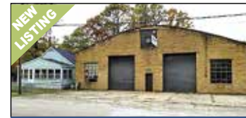
1099 Gordon Street Muskegon | $249,000