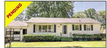
1657 Leif Norton Shores | $119,000