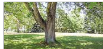
2350 Hughes Muskegon | $19,000