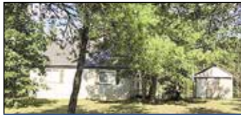
2974 E 56th Street Chase | $130,000