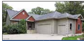
4223 Locksley Lane Twin Lake | $299,900