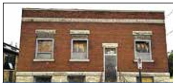
600 W Clay Avenue Muskegon | $125,000