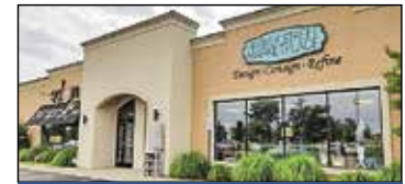
4905 S. Harvey Street Norton Shores | $395,000