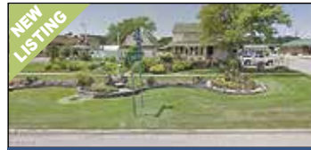
901 S. Beacon Blvd Grand Haven | $949,000