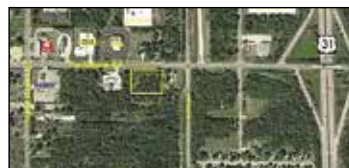
1161 E. Pontaluna Road Norton Shores | $229,000

Looking to BUY or SELL your home? Core Realty Partners is equipped with a team of licensed and highly experienced professionals that would love to assist you in your journey! Our team is committed to providing the utmost professional and efficient services! Here at Core Realty Partners , we work by YOU , with YOU , and for YOU !