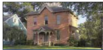
461 W Webster Ave Muskegon | $229,900