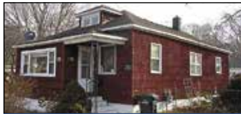
1728 Division Street Muskegon | $59,900