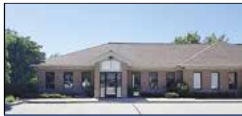
17212 Van Wagoner Road Ferrysburg | $11.00 SF