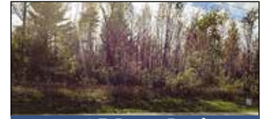
753 E. Porter Road Norton Shores | $77,000

Tom Sanocki 231-375-5271 Core Realty Partners 231-375-5273