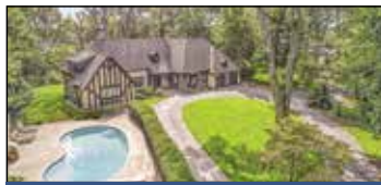
311 W. Circle Drive North Muskegon | $695,000