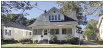
1282 Palmer Ave Muskegon | $139,900