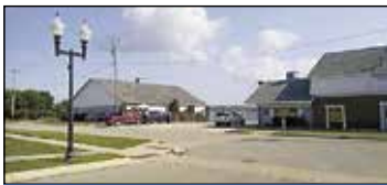
200 River Street Manistee | $1,850,000