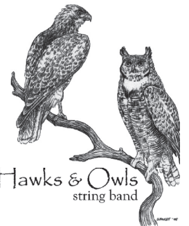
Hawks & Owls string band

Hawks and Owls String Band has been delighting audiences around West Michigan since 1997. They specialize in original and time-savored traditional folk songs.