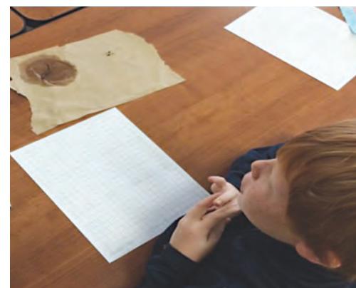
Tyler Lindell listening to instruction before the dissection