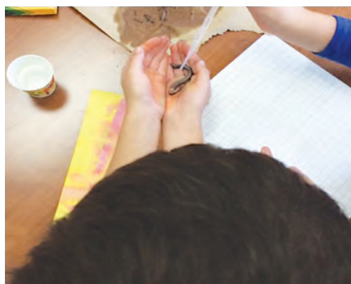
Two students doing a test on the worm