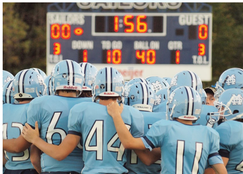
Top: Support of our varsity football games set attendance records.