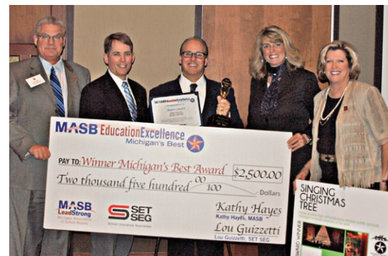
Right: Singing Christmas Tree wins Statewide Award for Excellence.